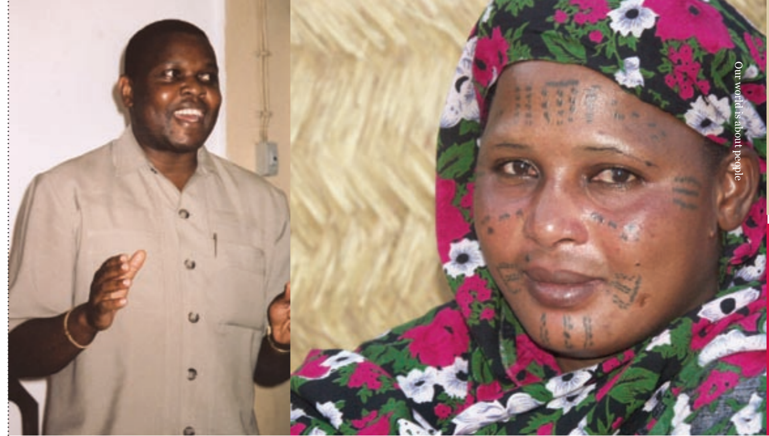
Our world is about people

CaBESA is a comprehensive package of tailor-made training, coaching and advice targeted to development organisations for capacity building of their staff in line with an organisational development plan. CaBESA is an MDF-ESA development service.